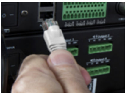
Amp Link and CAT 5